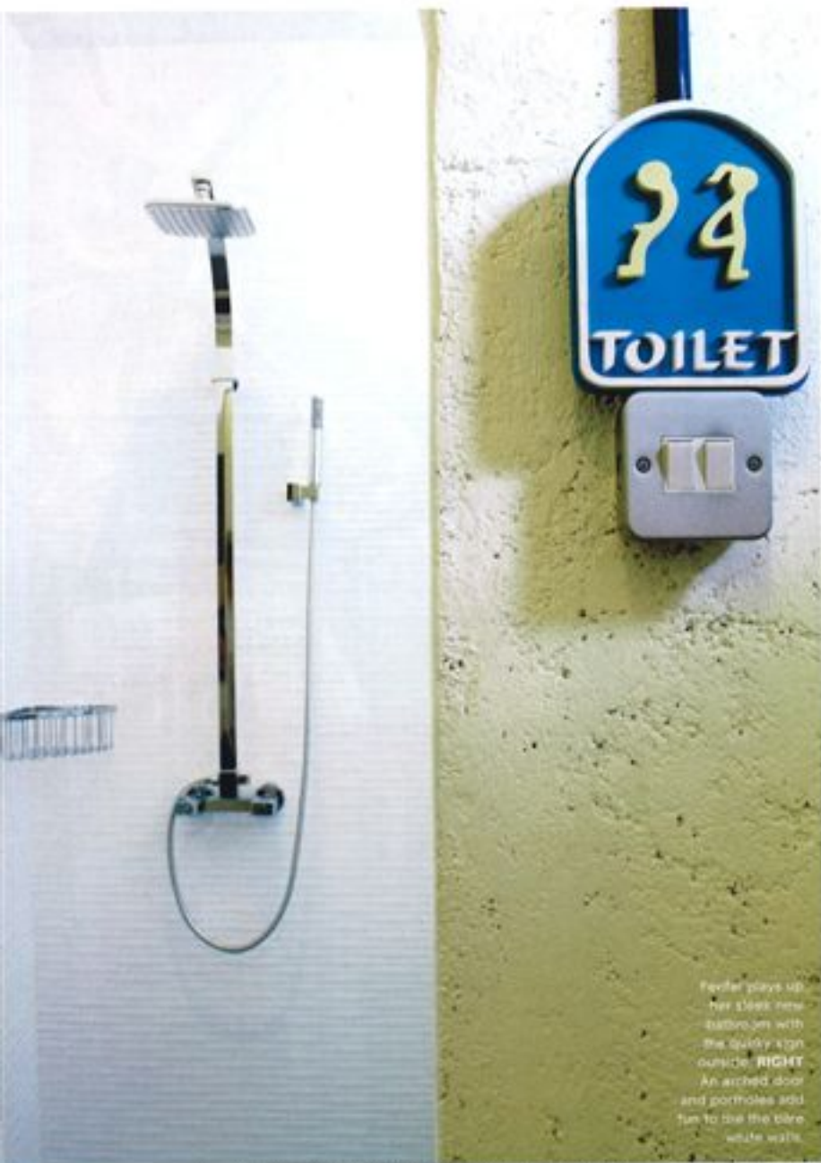
Fenfei plays up her sleek new bathroom with the quirky sign outside. RIGHT An arched door and portholes add fun to the bare white walls.

Fenfei says there is a lot of room for growth in the 1,100sqf residence – a spare bedroom should the in-laws choose to move in and a study area that can be turned into another bedroom “when we decide to have children” are already in place. With the fun vintage pieces and the subway station look, it’s easy to imagine children having a blast growing up in and running around this house. Of course, the stark white walls would be a convenient and tempting canvas for a child’s crayon doodles, but they would simply add even more character to Fenfei’s home.